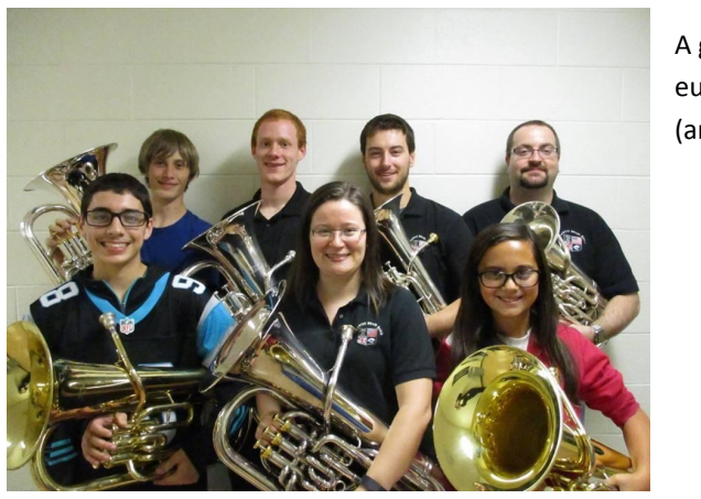
A gaggle of euphoniums (and baritones)

There was no let up in the excitement this fall as the very next week saw the Youth Band kick off and side by side with ABB. A large and enthusiastic group of high-schoolers came out for the new season. After a coaching session/rehearsal with Bryan A-W and the coaching staff the youth performed.