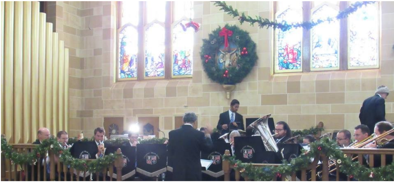
Atlantic Brass Band