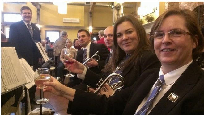
ABB WISHES ALL OUR FRIENDS A HAPPY NEW YEAR

For more on the picture above go to page 4.