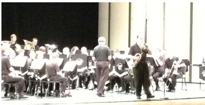
ABB KICKS OFF 30TH SEASON

For more on the picture above go to page 4.